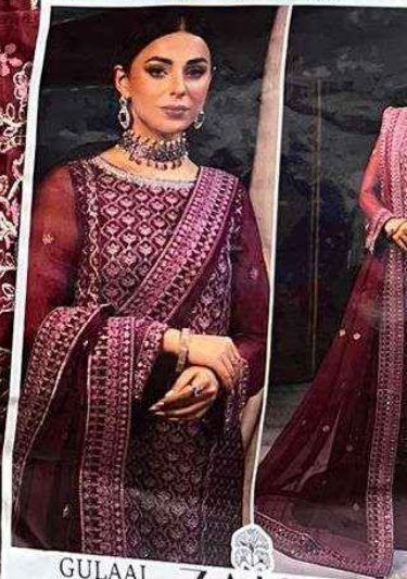
GULAAL Vol-4 TOP Faux Georgette with Embroidery (Cut-2.5 Mtr.) BOTTOM-INNER Dull Santoon (Cut-4.20 Mtr.) DUPA ZAHA D.No