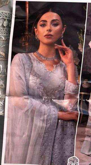
GULAAL Vol-4 TOP Faux Georgette with Embroidery (Cut-2.5 Mtr) BOTTOM-INNER Dull Sant (Cut-4.20)