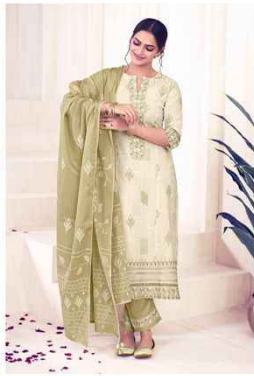
LOOK | 8984