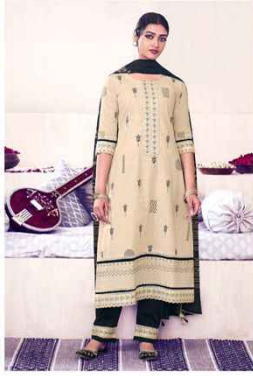
LOOK | 8983