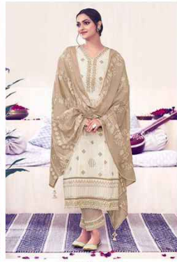
LOOK | 8986