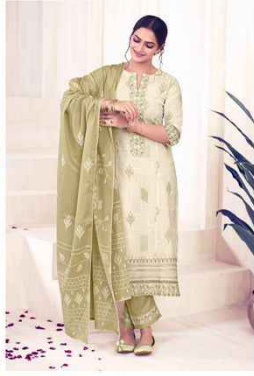
LOOK | 8984