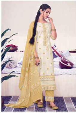
LOOK | 8981