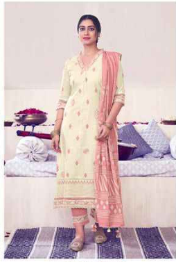
LOOK | 8982