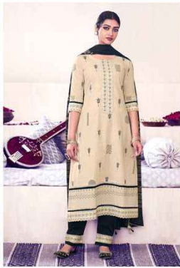
LOOK | 8983