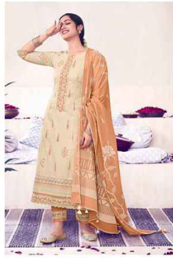
LOOK | 8985