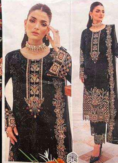
Shezli TOP Fake Georgette with Embroidery (Cut: 2-5 Mtr)