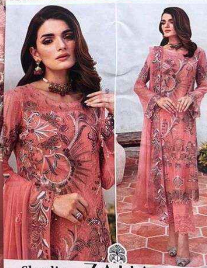
Shezlin ZAHA D.No.1024 TOP Faux Georgette with Embroidery (Cut-2.5 Mr.) BOTTO & INNER Full Santoon DUPATTA Nazam (Cut)