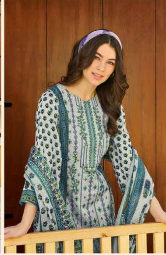
dress shabliq and they remember D.NO-3302 the dress: dress impeccably and they notice the woman.