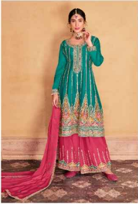
CODE | 2053