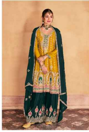
CODE | 2052