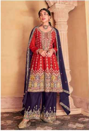
CODE | 2051