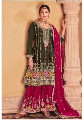
CODE | 2054