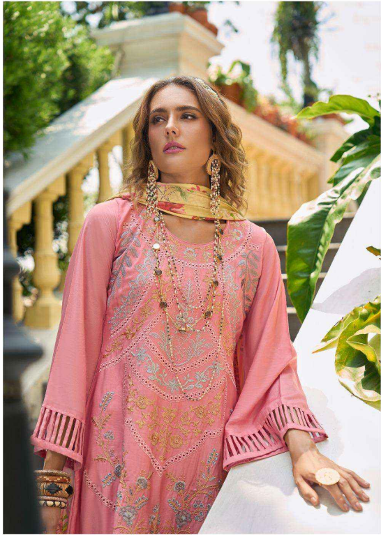
Neishi : 1001