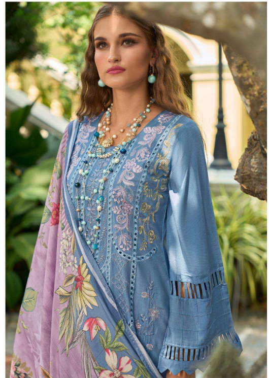
Neishi : 1003