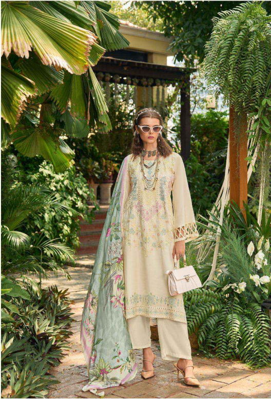
Neishi : 1004