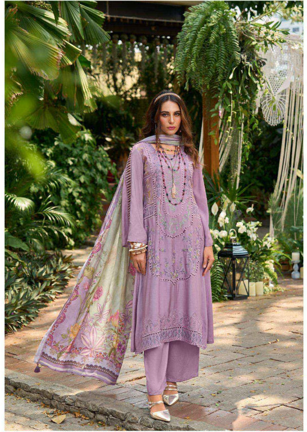
Neishi : 1005