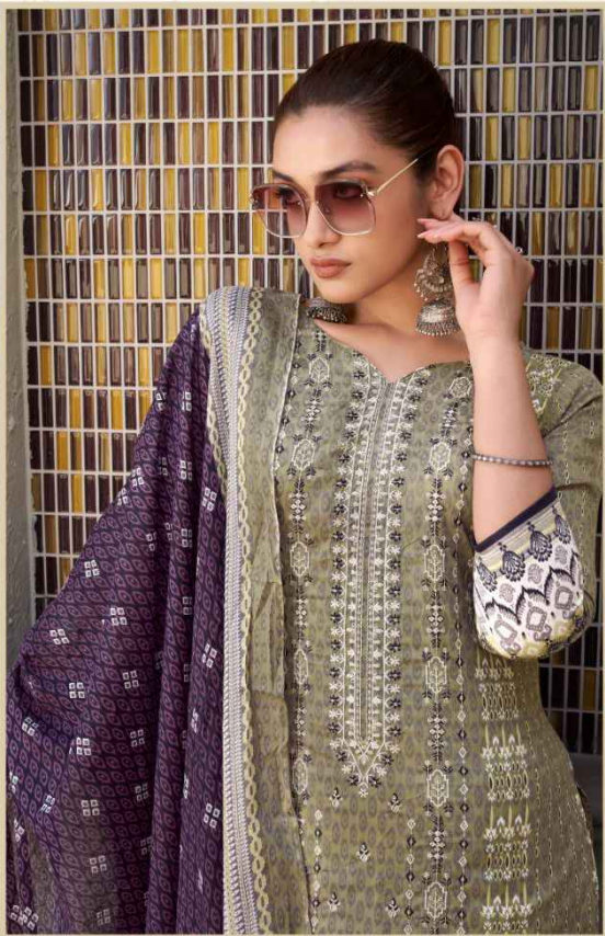
Code # 1010