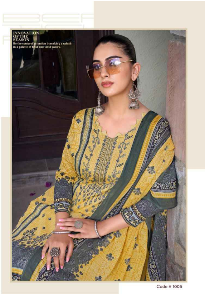
Code # 1005