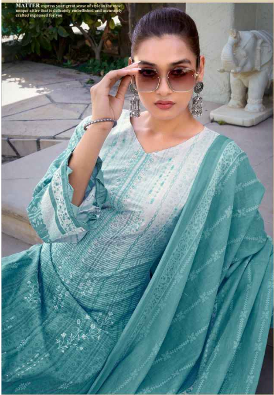
Code # 1002

LOOK THAT MATTER express your great sense of style in the most unique attire that is delicately embellished and accurately crafted expressed for you