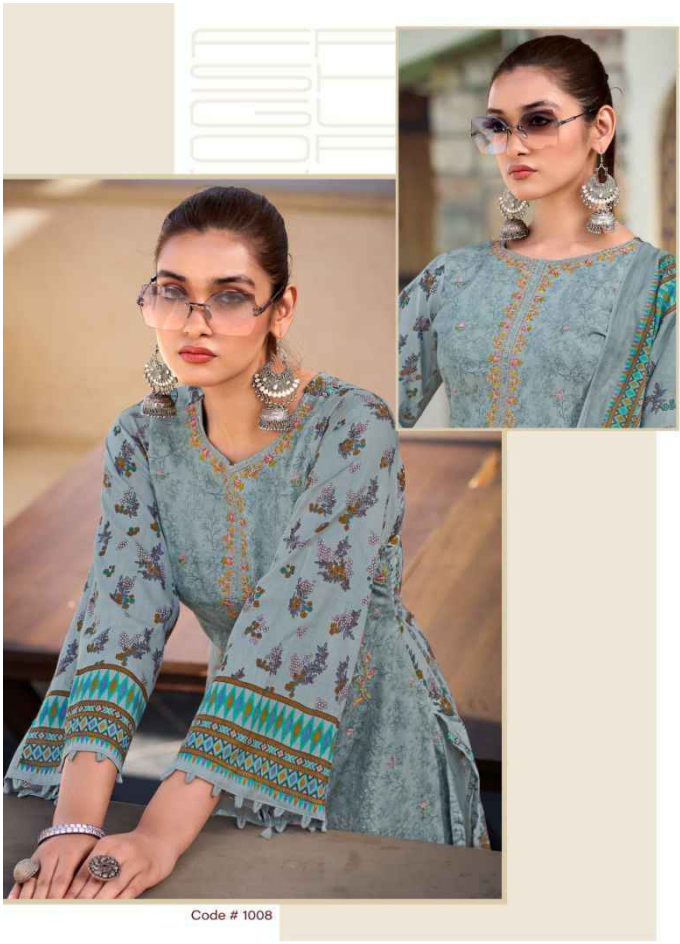
Code # 1008