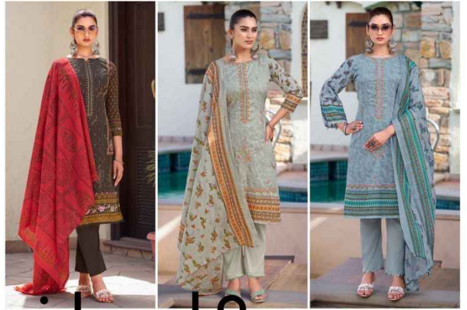
Code # 1007