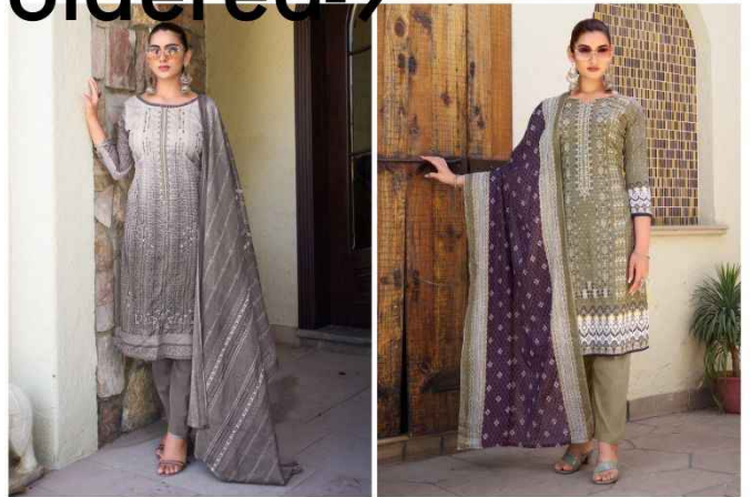
Code # 1009