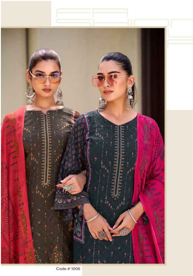
Code # 1006