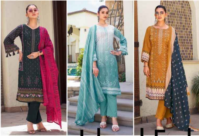
Code # 1001