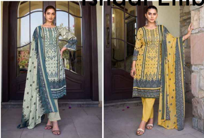
Code # 1004