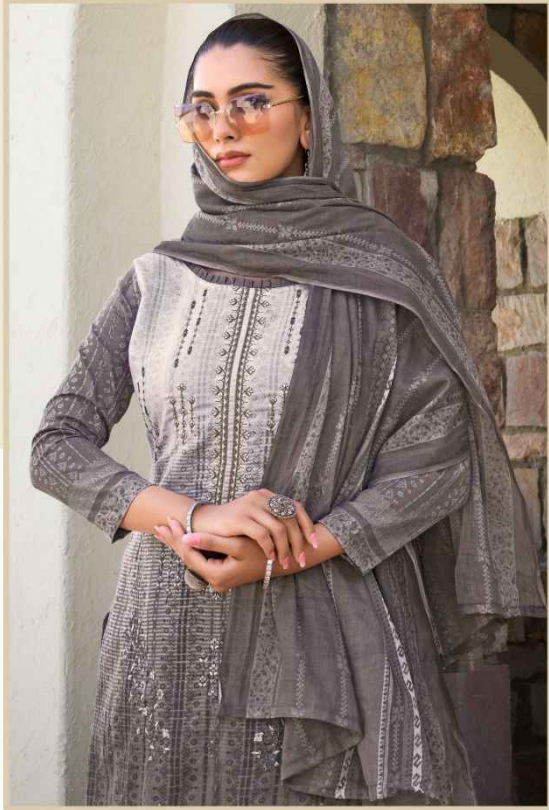
Code # 1009