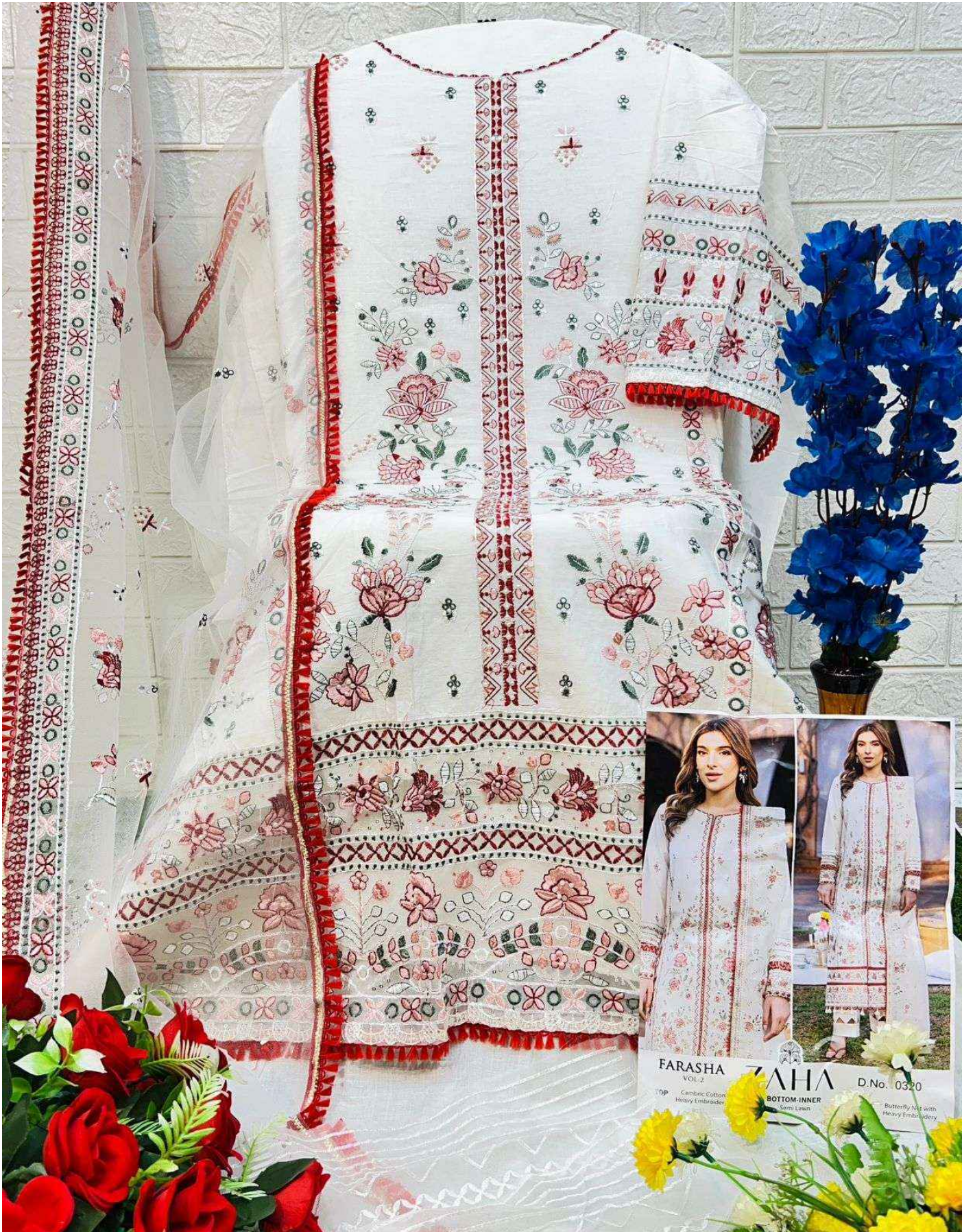
FARASHA VOL. 2 ZAHARA D.No. 0320 TOP Cambic Cotton Heavy Embroider BOTTOM-INNER Semi Linn Butterfly Net with Heavy Embroidery