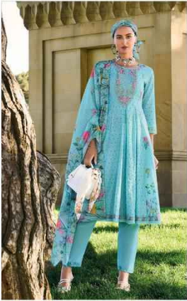
✧ 42713 ✧