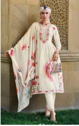
✧ 42711 ✧