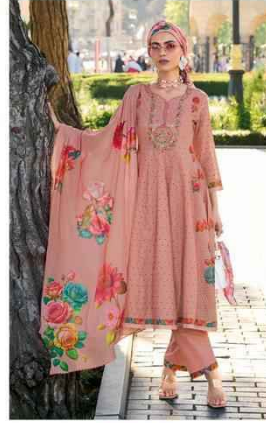
✧ 42715 ✧