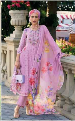
✧ 42714 ✧