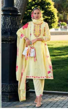
✧ 42712 ✧