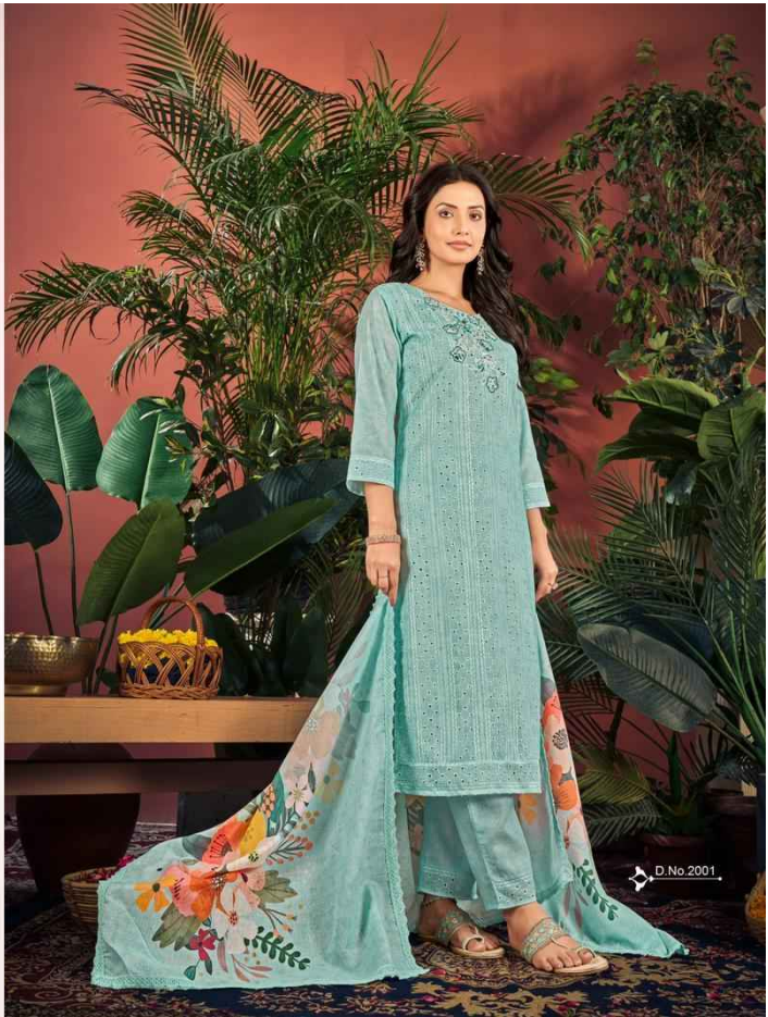
"Elegance Woven in Every Thread, Dresses that Define True Beauty."

A SYMPHONY of fresh tones and FLORAL IMAGERY SPRING SUMMER 20 2 4