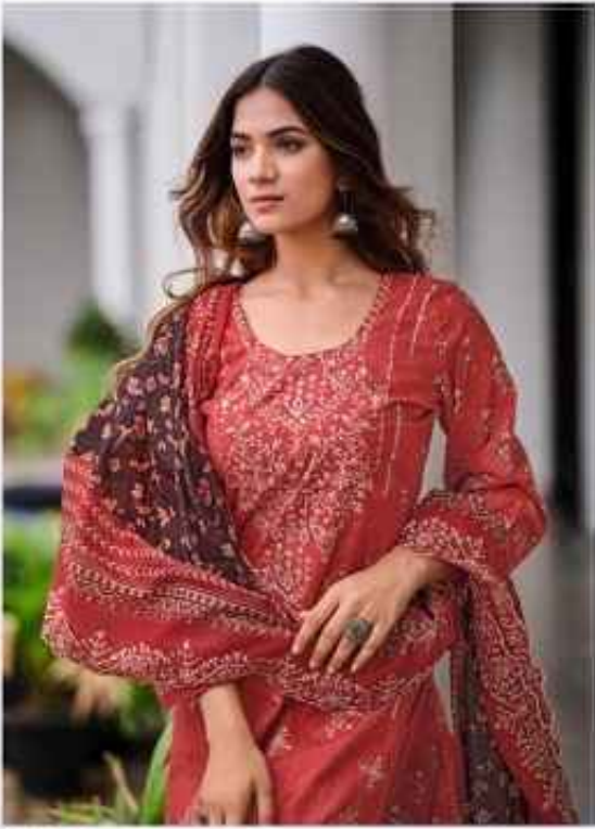
Design: (Trendy design, color of twill)