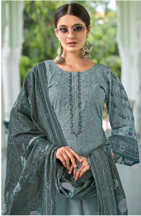
"Fabrics of Grace, Dresses that Embrace – Unveiling Your Radiant Culture."