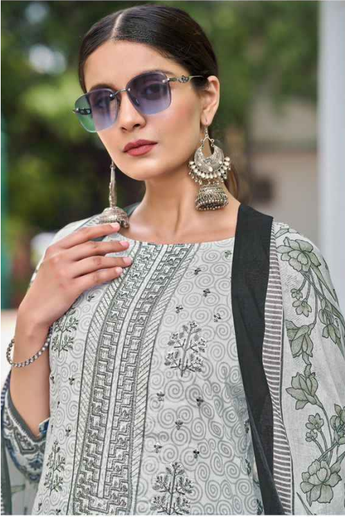
"Cultural Elegance, Quality's Bloom, Dresses that Exude Beauty's Perfume."