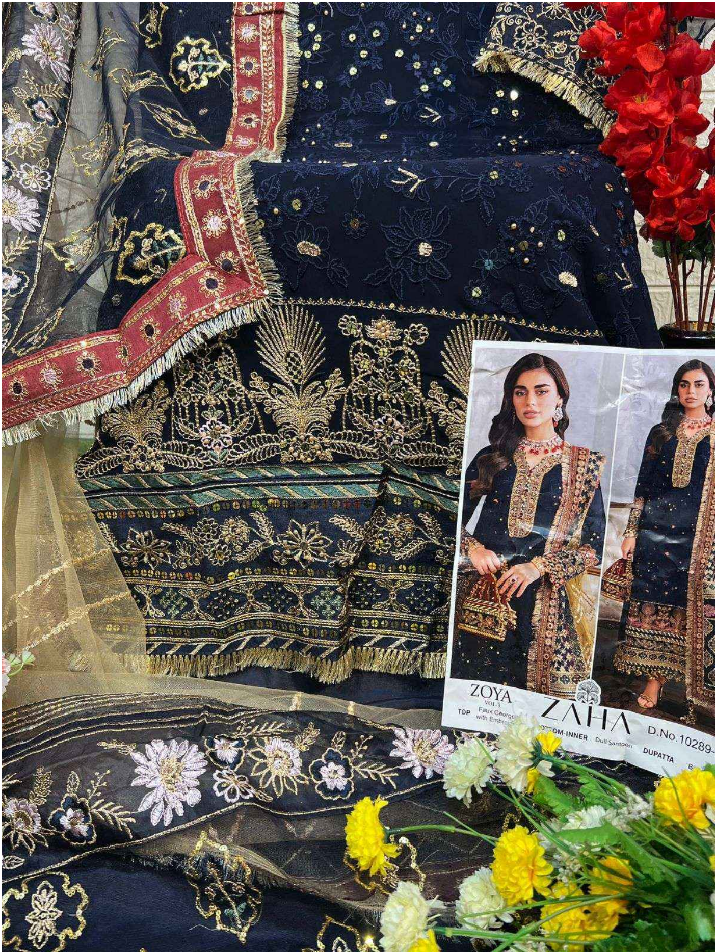
ZOYA VOL.3 TOP Faux Georgette with Embroidery ZAHA Dull Santoon BOTTOM-INNER DUPATTA D.No.10289-