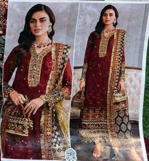
ZOYA VOL. 3 TOP: Faux Georgette with Embroidery ZAHIA BOTTOM: Faux Georgette with Embroidery D.No. 10289-A DUPATTA: Butterfly net