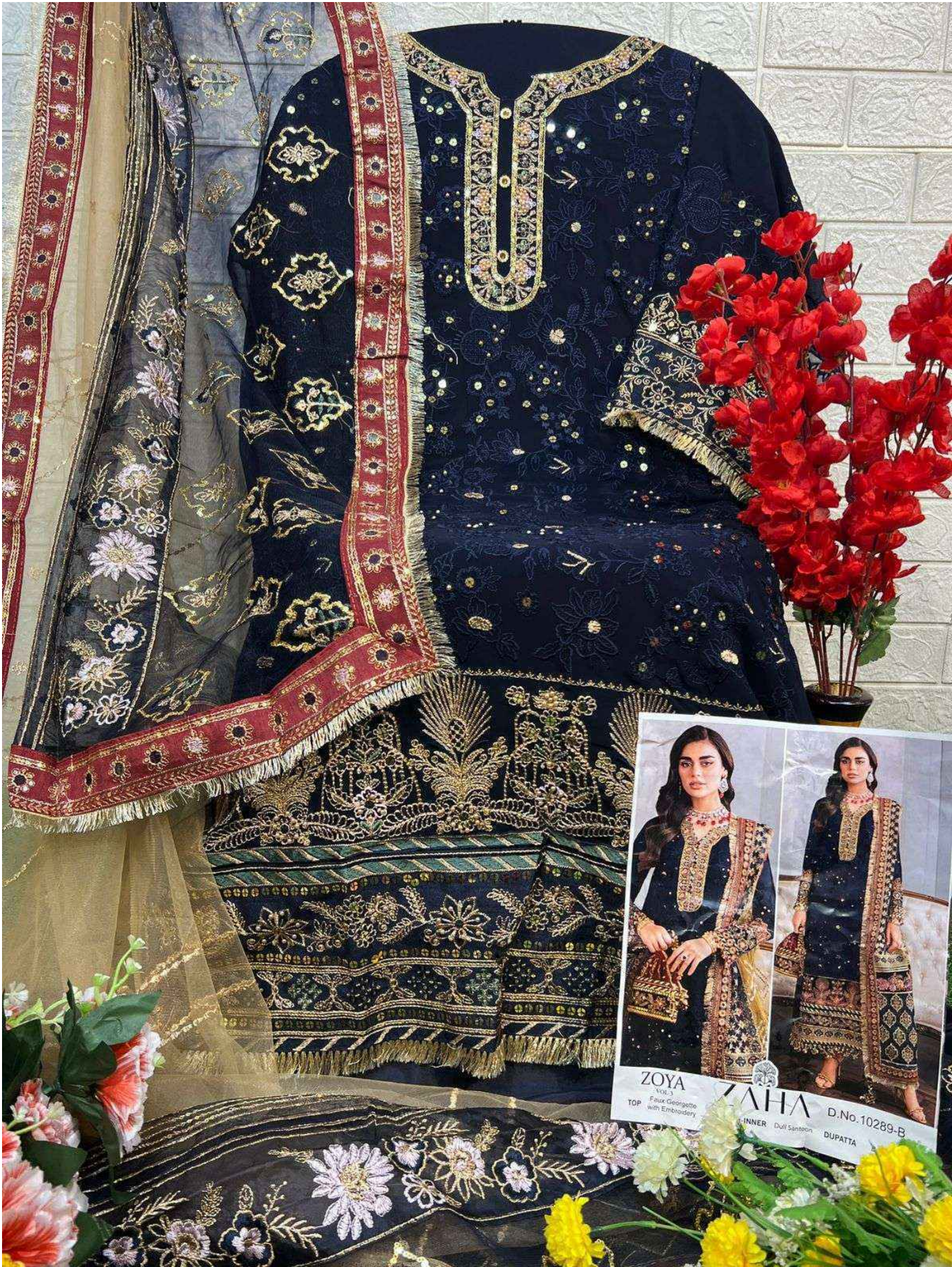
Zoya VOL. 3 FAUX GEORGETTE WITH EMBROIDERY ZAHA D.No. 10289-B INNER Duff Sansoon DUPATTA