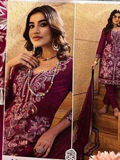
INARA ZAHIA TOP - Cambric Cotton With Heavy Embroidery Work 80