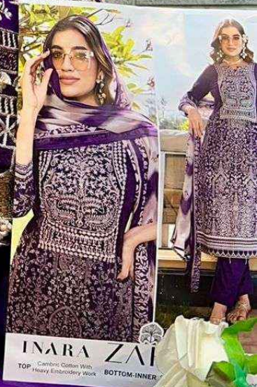
INARA ZAI TOP: Cambric Cotton Weft, Heavy Embroidery Work BOTTOM: INNER