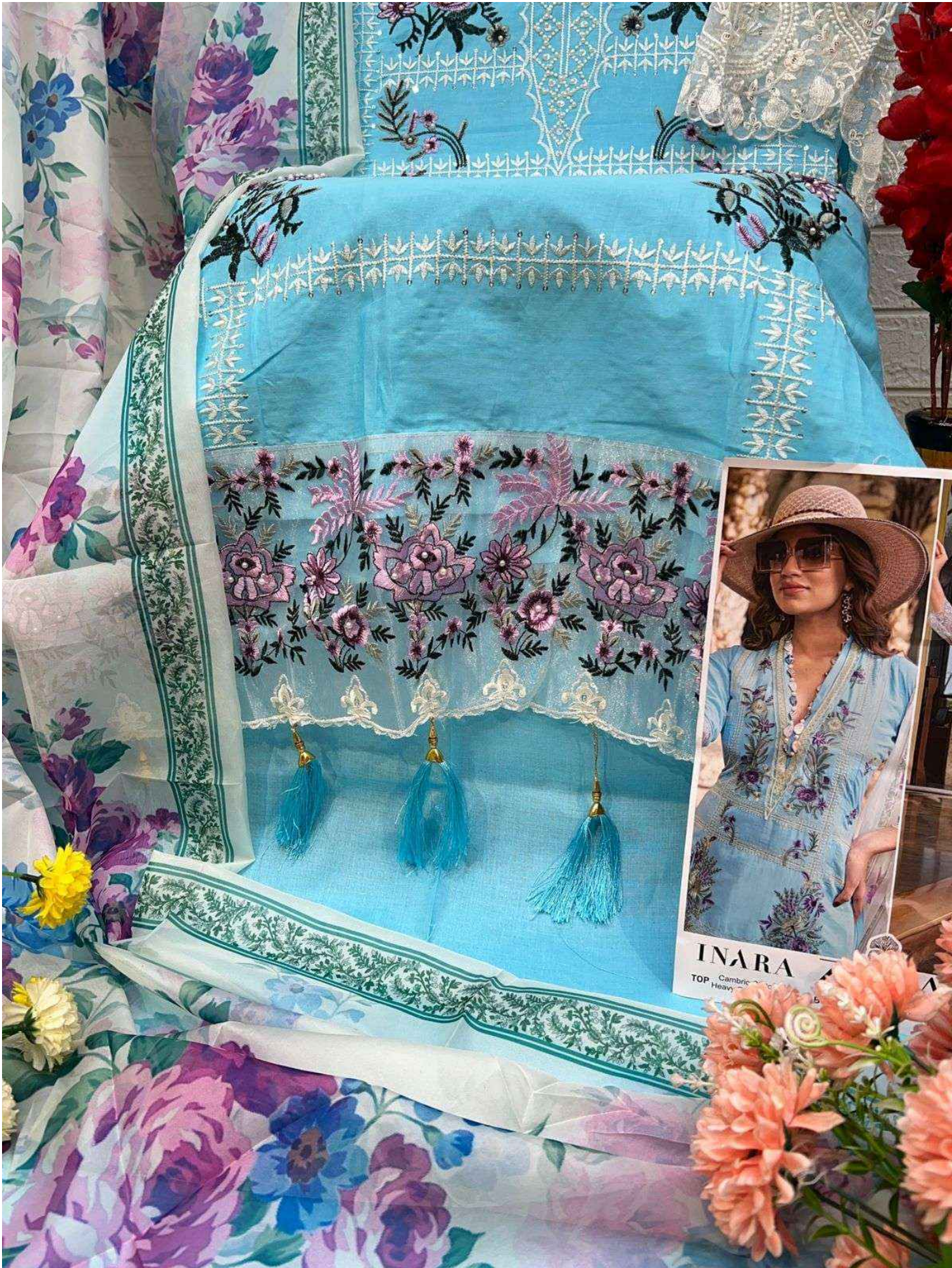
INARA TOP Cambric Heavy