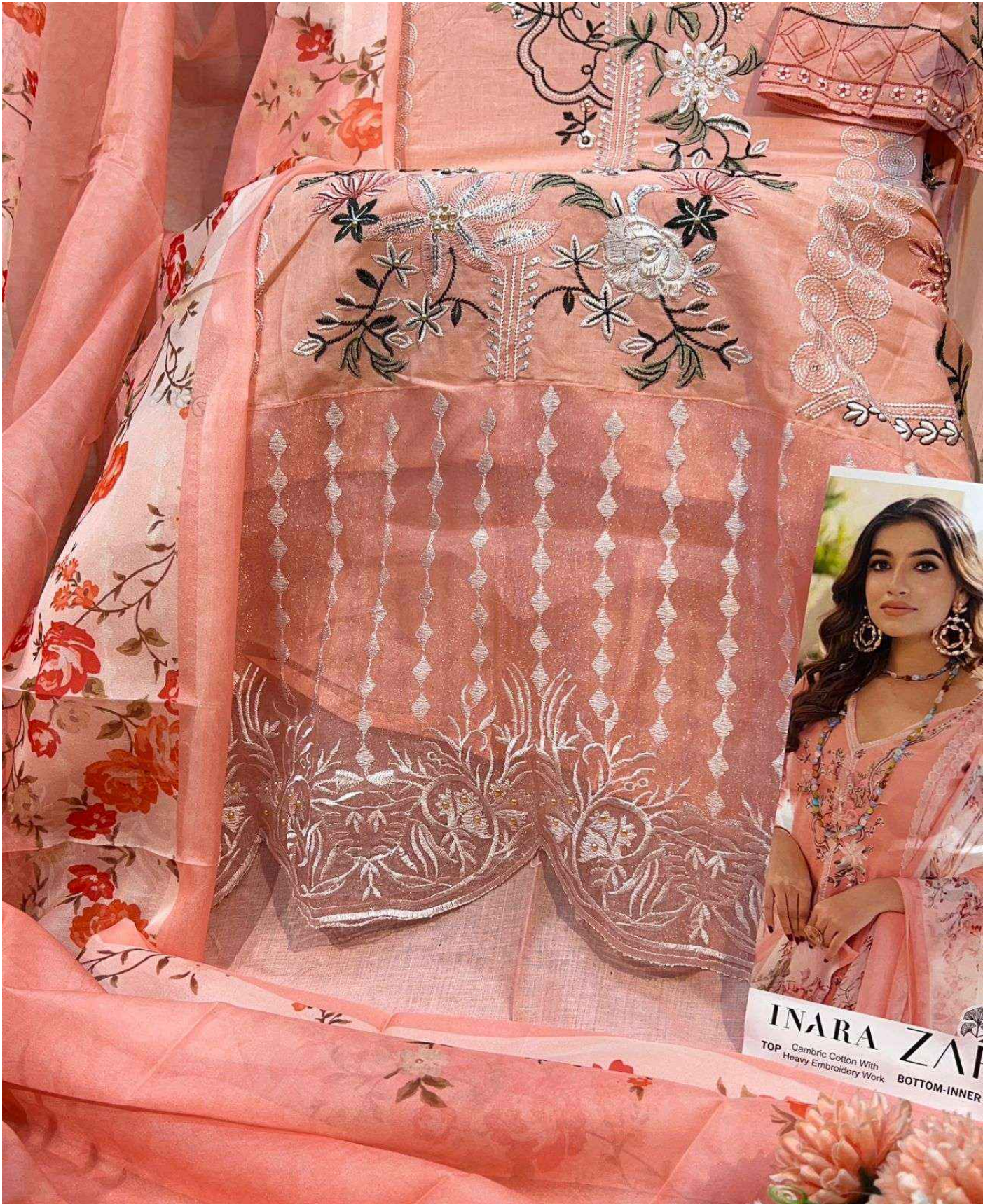
INARA ZAI TOP Cambric Cotton With Heavy Embroidery Work BOTTOM-INNER