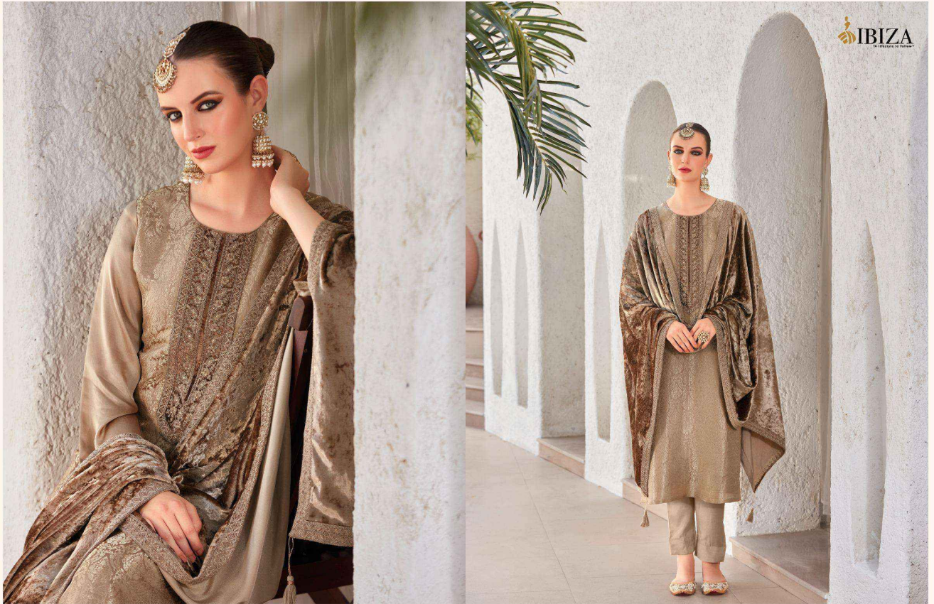
STYLISH ELEGANCE ● ● ● ●