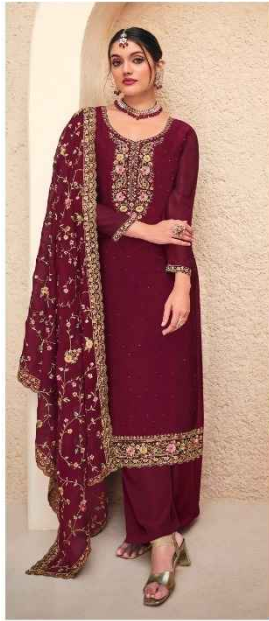
CODE | 1181