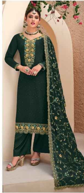
CODE | 1182