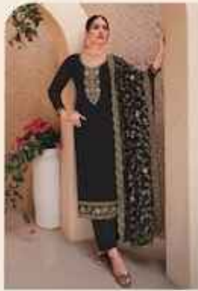
CODE: I 1184