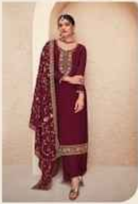
CODE: I 1181