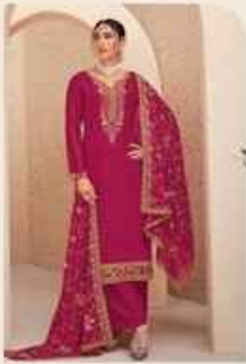
CODE: I 1183