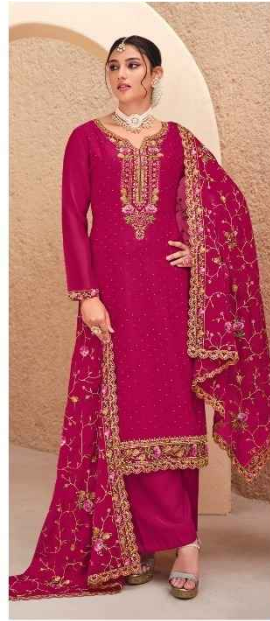
CODE | 1183