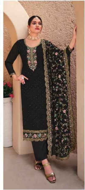
CODE | 1184