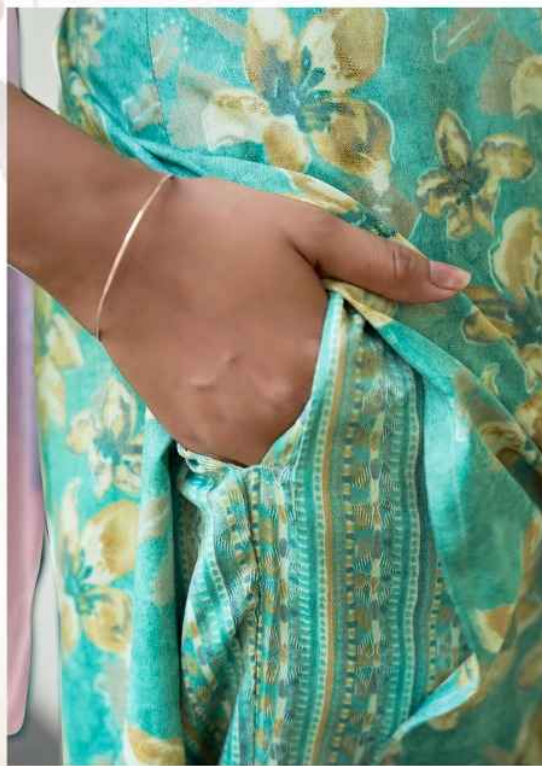
SLAYING WITH CLASS IN MY SALWAR SUIT