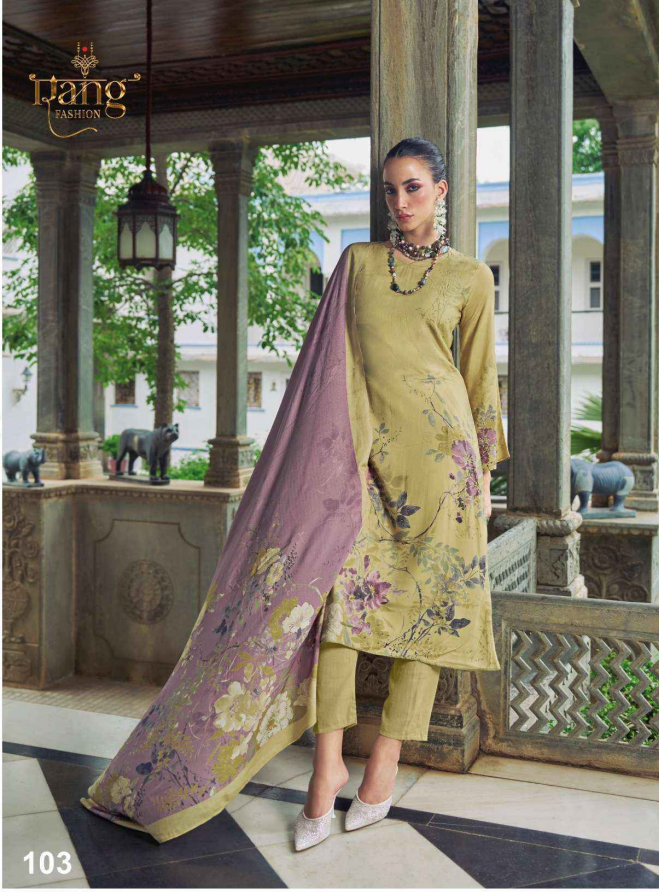
Never, ever confuse what happens on a runway with fashion. A runway is spectacle. It's only fashion when a woman puts it on