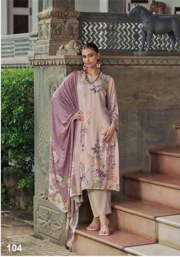
104 What you wear is how you present yourself to the world, especially today, when human contacts are so quick. Fashion is instant language