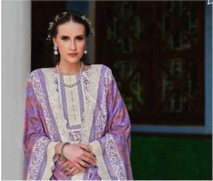
Model is not responsible for the coloring and the embroidery for the photos.