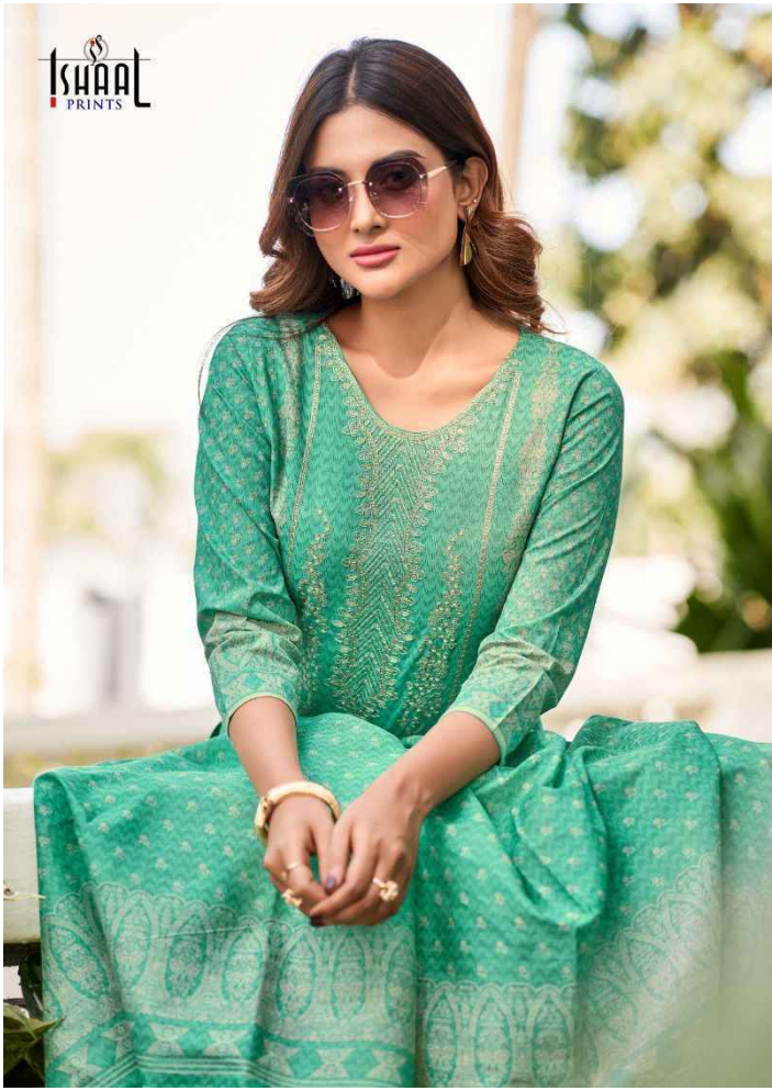
"The Art of Ethnicity, The Beauty of Nature."