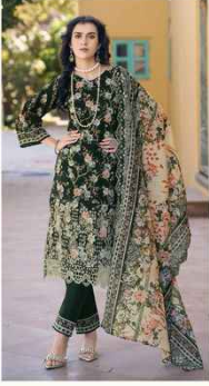
❁ 5401 ❁