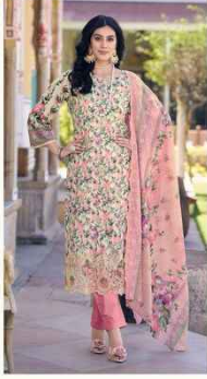
❁ 5402 ❁