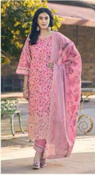
❁ 5407 ❁