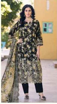
❁ 5403 ❁