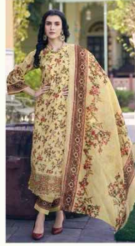
❁ 5404 ❁