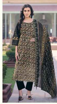
❁ 5405 ❁