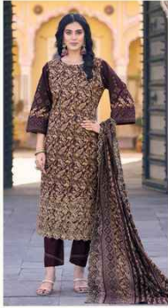
❁ 5408 ❁