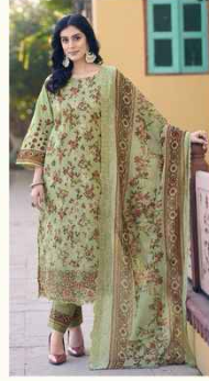
❁ 5406 ❁