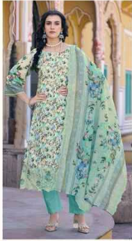
❁ 5409 ❁