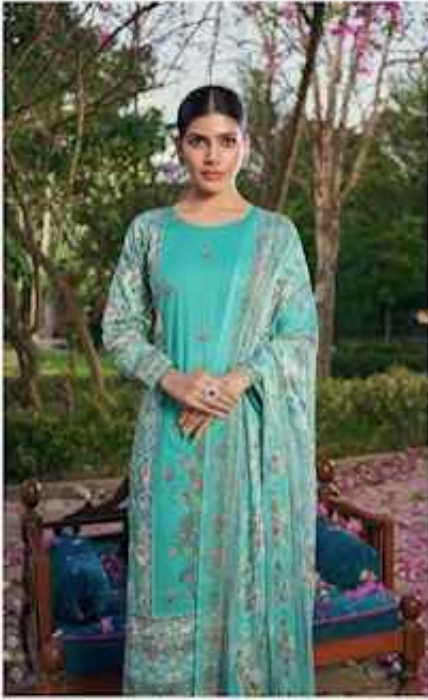
TRADITIONAL SALWAR KAMIZ