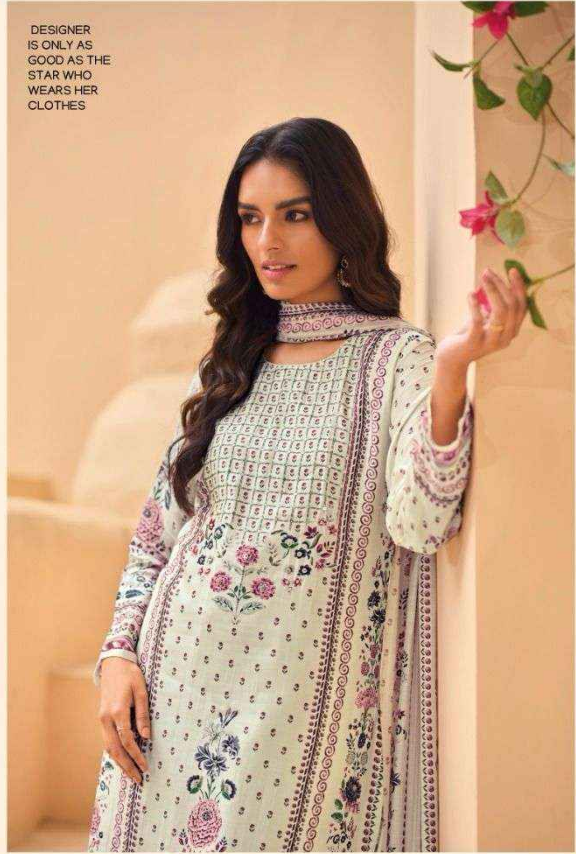
TREND FASHION / 2024